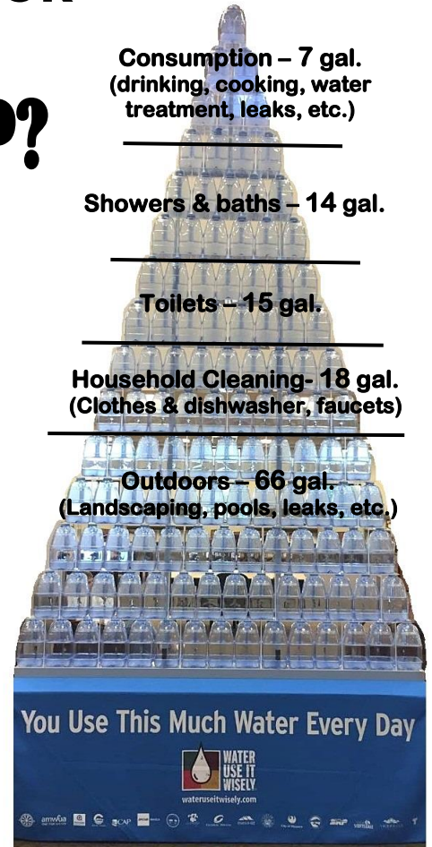
120 gallons used by each person daily

[Hint: your water bill may indicate your consumption in 1,000 gallon units or by CCF's which stands for a hundred cubic feet. 1 CCF= 748 gallons. The chart below gives you examples of how to use each unit of measure]